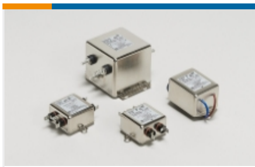
Single Phase Filters(42)